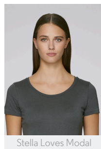
Stella Loves Modal